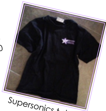
Supersonics t-shirt $28.00