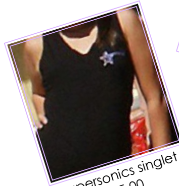
Supersonics singlet $25.00