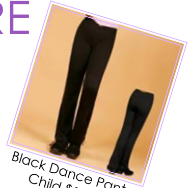
Black Dance Pants Child $18.00 Adult $38.00

All students are required to wear leather tan Jazz shoes as a part of their class uniform. To measure your child's shoe sit her on the floor with her legs straight ahead, place ruler from heel to top of toe. If you can then let me know in cm how long her foot is, I will then bring sizes in accordance to the length.