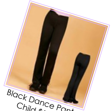
Black Dance Pants Child $18.00 Adult $38.00

All students are required to wear leather tan Jazz shoes as a part of their class uniform. To measure your child's shoe sit her on the floor with her legs straight ahead, place ruler from heel to top of toe. If you can then let me know in cm how long her foot is, I will then bring sizes in accordance to the length.