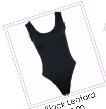
Black Leotard $15.00